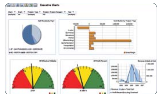
Fig. 2: The pre-configured Executive role-based dashboard provides data about the overall financial health of your business.